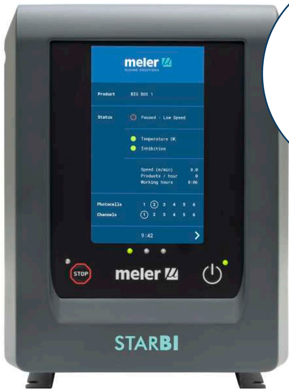
STARBI 4 or 6 channels