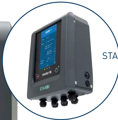
STARBI 2 channels